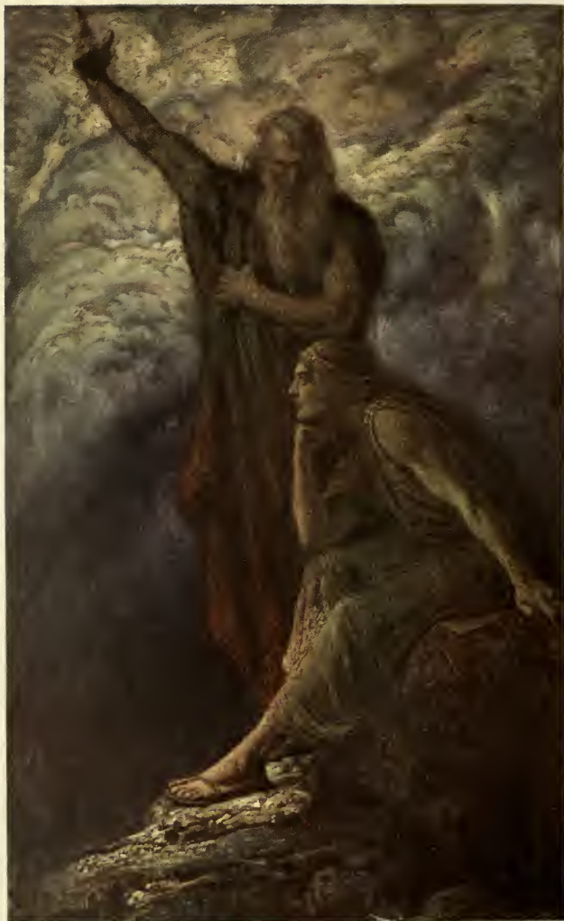
From a Painting by Sigismond de Ivanowski